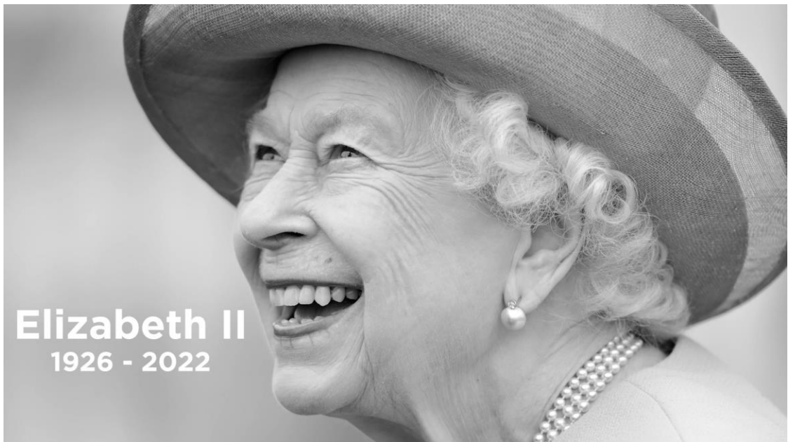
Elizabeth II 1926 - 2022

We wanted to share our prayer from this morning's worship with you all.