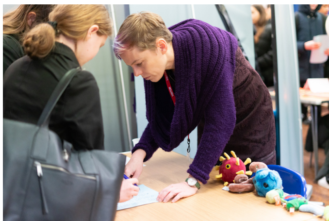
University for the Creative Arts