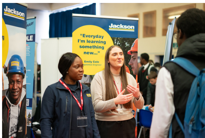
North Kent / Hadlow College