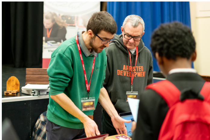
Jackson Civil Engineering