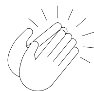
North Kent / Hadlow College