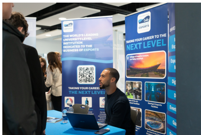
University of Kent